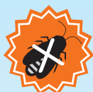
insect-proof design (patent)