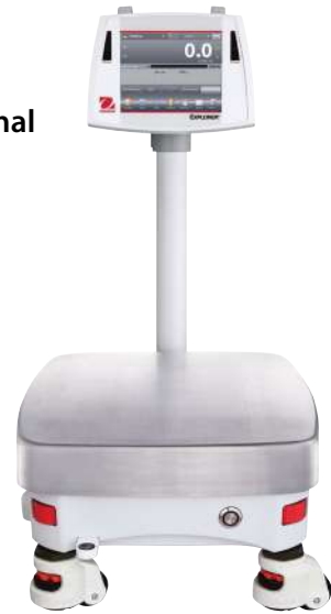
Shown with optional tower mount and rolling feet