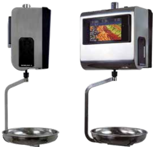
9" rear screen