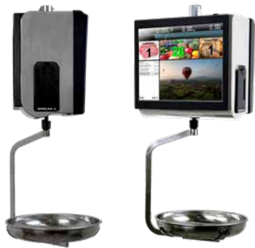
15" rear screen